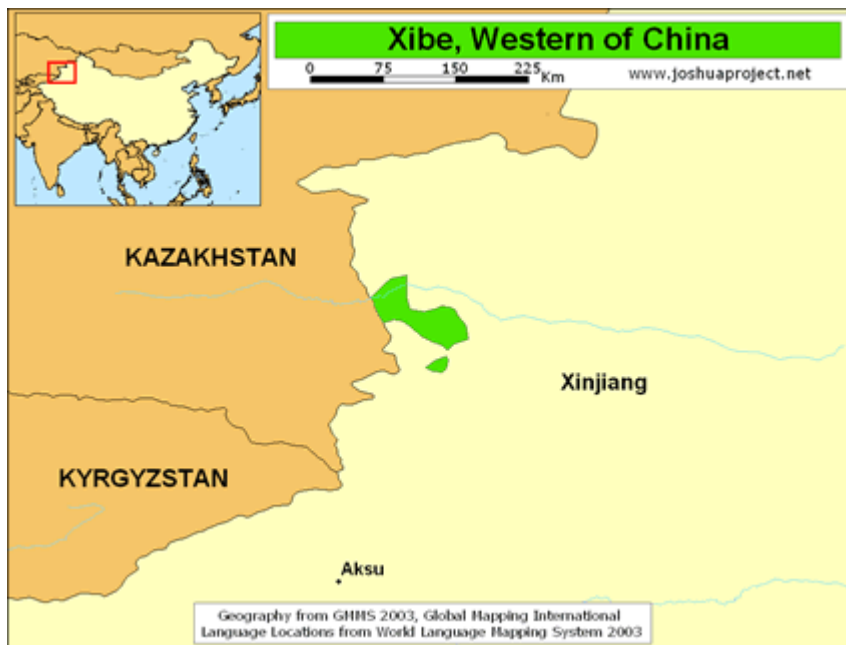
Map Source: Joshua Project / Global Mapping International